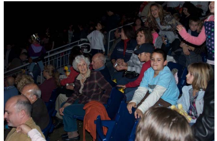
Bridgeport AHEPA has a family night at the circus, fun by all.