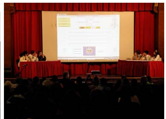
The Game Show format was enjoyable, entertaining, and enlightening. A Great Day, all that was missing was Vana White.